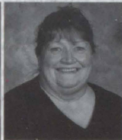
Patricia Hart Lunchroom